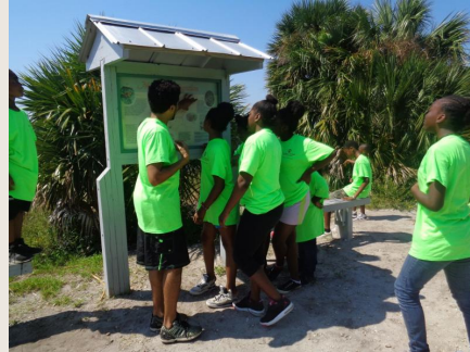
COVE at St. Marks National Wildlife Refuge