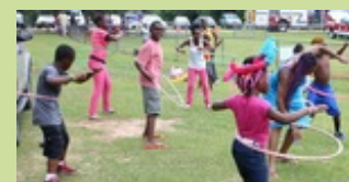
Hula Hoops, kids.

Great giveaways for winning the hula hoops contest. Try it out June 20, 2015.