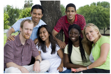
AS CHRISTIANS, WE ARE ONE MIND, ONE BODY & ONE SPIRIT! EPHESIANS 4:4

When we truly look like Jesus, we are able to do greater works than Him—healing, saving the lost, and miracles. We don't have to wait for Him because He's given us what we needed more than 2,000 years ago. Our job is to “just do it.” Take your rightful place believers so we can be of one mind, one body, and one spirit.